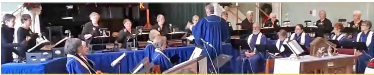
Thursday nights find the members of the Handbell and Adult Choirs in Room 9 for practice